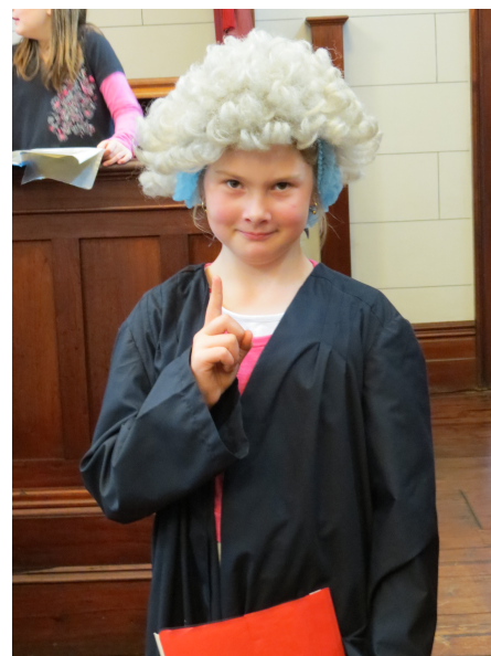
Prosecuting Ned Kelly