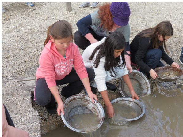
Panning for gold